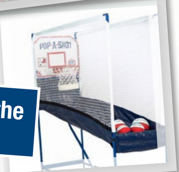
Pop-A-Shot for the Wolverine Den