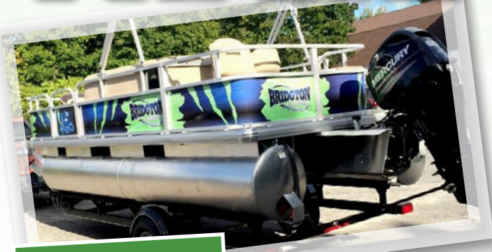
Pontoon Fishing Boat

CAMPERS, PARENTS AND STAFF (new & old) are all eligible to participate in our March Madness College Basketball Tournament . The winner will receive a personalized BSC jersey of their choice. We will also have 2nd and 3rd place prizes. Instructions will be posted on our facebook page and emailed out in February.